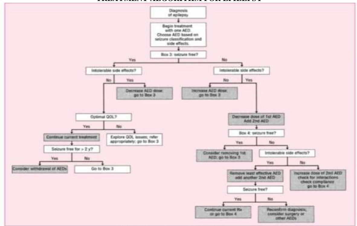
FIGL/RE 54-1. Algorithm for the treatment of epillepsy.